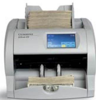
JetScan iFX™ i100 Currency Scanner