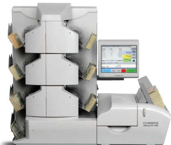
...or maybe you're ready for 7 pockets...