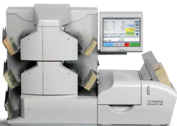
...Expand to 5 pockets...

Navigating to frequently used count and sort operations takes less time and effort. For even greater functionality, choose the one-touch-plus operating software to create multiple processing types, enter coin and non-cash items into batch totals, and accommodate future processing features.