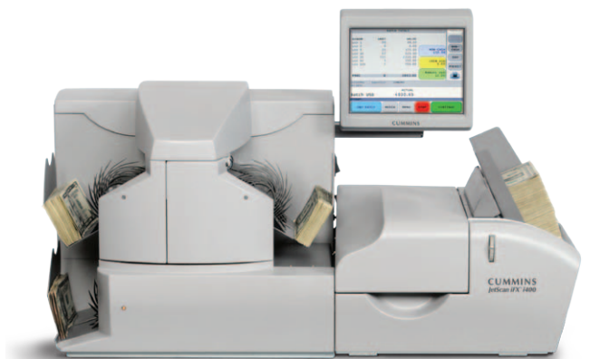
Start with 3 pockets...

From the number of pockets to the horizontal or vertical configuration, the JetScan iFX i400 gives you the ability to create a customized system specific to your operations. At any time, existing pockets can be reconfigured or more pockets can be added. Easily and economically.